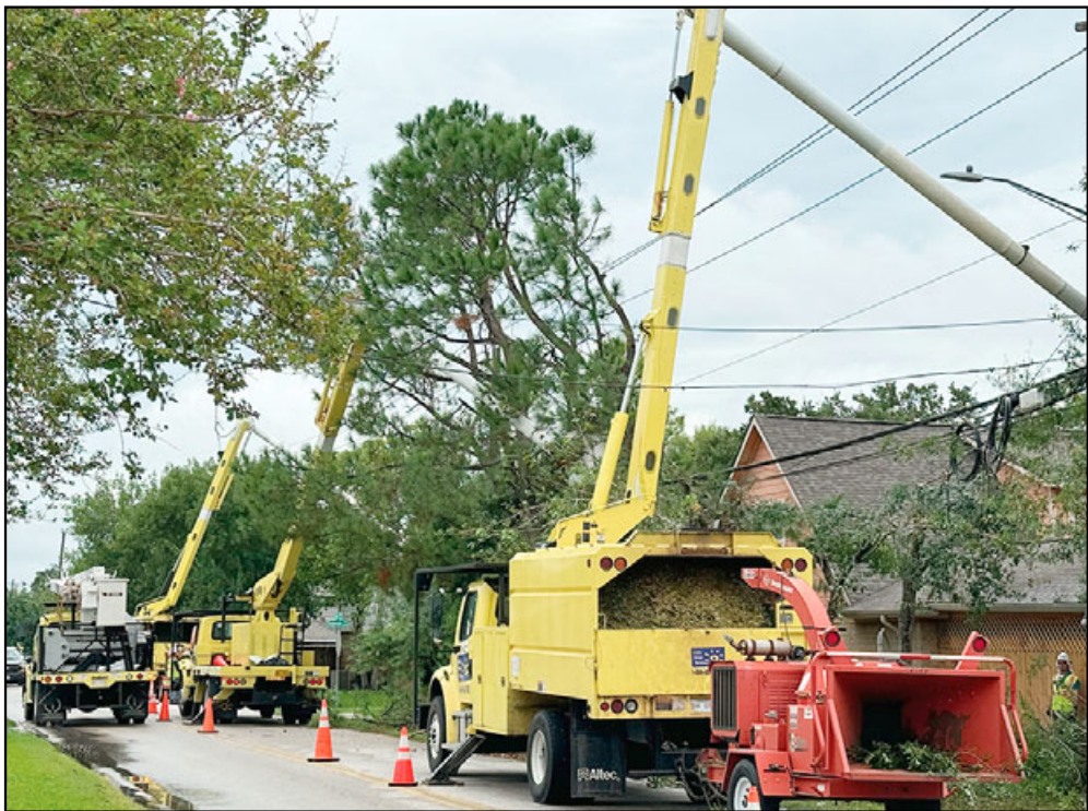
As the South Belt community recovers from the widespread power outages following Hurricane Beryl, crews from CenterPoint Energy are already trimming trees located near area power lines in preparation for the next possible storm. The power company faced harsh criticism from both residents and elected leaders alike for its storm preparation and recovery efforts, leaving thousands without electricity for more than a week after the storm. CenterPoint crews are shown Sunday, July 28, trimming trees along Hall Road.