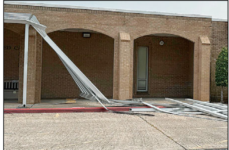
Frazier Elementary did not escape the wrath of Hurricane Beryl as some damage to the outside of the school was evident Monday after the storm passed.