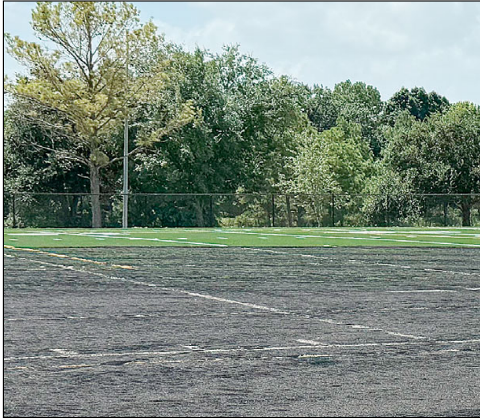
The turf covered athletic field for the Houston Gateway Academy located in Riverstone subdivision caught fire about 4 a.m. July 4. The school, which has been in some stages of planning since 2010, is finally nearing completion. The turf was installed last month. The fire destroyed about one-third of the turf. It was reported started by fireworks.