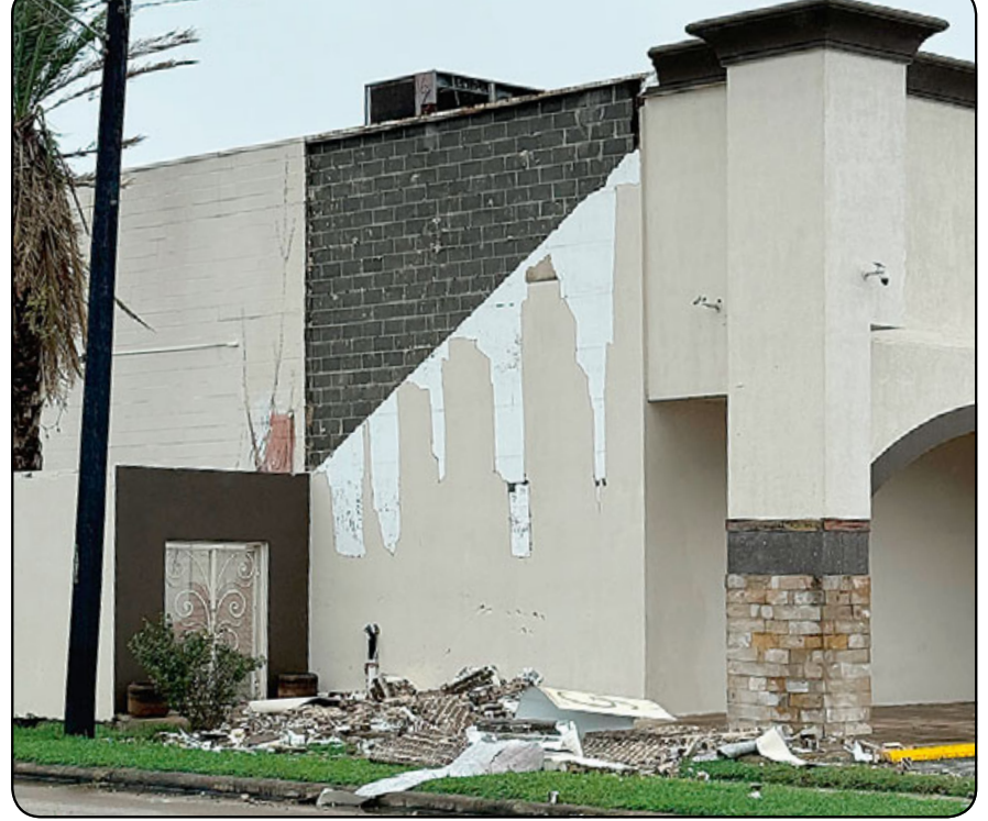
A tour of the South Belt area showed the majority of the damage from Hurricane Beryl was to trees and fences, although there were some exceptions including the Gardens of Houston, on Beamer, near Hughes Road. While the outside sustained damage, the majority of the building was spared. (See more Beryl photos Pages 2.)

According to local officials, Beryl claimed at least seven lives in the Greater Houston area. Most of the deaths were caused by falling trees but at least one resident - a civilian with the Houston Police department - was killed by floodwater and another death appeared to be caused by lightning.