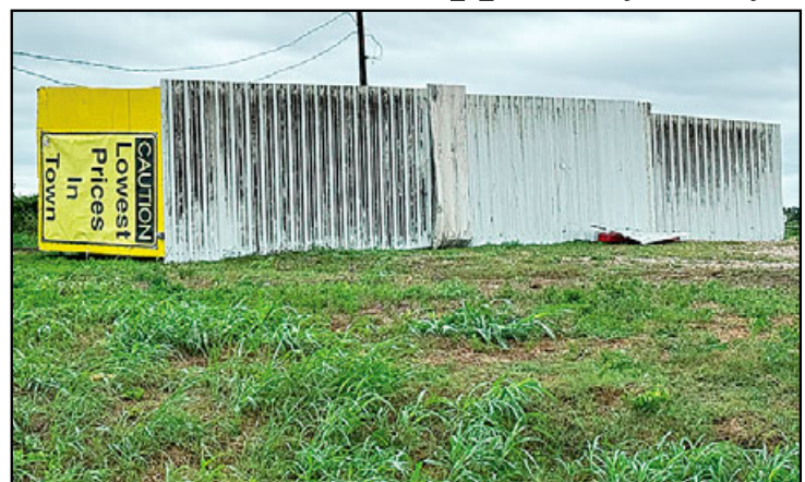
A fireworks stand at the corner of Beamer and Dixie Farm Road was blown over by the winds of Beryl. Winds from Hurricane Beryl reached nearly 90 mph as it passed through Houston. No one was in the facility at the time, so there were no injuries.