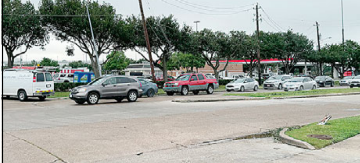
Tuesday saw many South Belters waiting to fill up their gas tanks. More than 25 vehicles waited in a double line at the Kroger gas station at Sabo and Beltway. Other area gas stations had similar waiting lines.