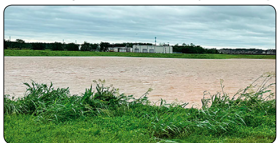
South Belt escaped what in the past would have been a heavy flooding situation. South Belt has been flooded with three inches of rain. The Beamer ditch recorded 8.04 inches of rain during Beryl. The above pond is one of the major drainage areas in what used to be the Southbend subdivision. Former Harris County Commissioner El Franco Lee agreed to buy the property and turn it into retention ponds when approached by community members. Without this work, Hurricane Beryl would have flooded many. Additional drainage retention came from the improvements on the Beamer Road ditch.