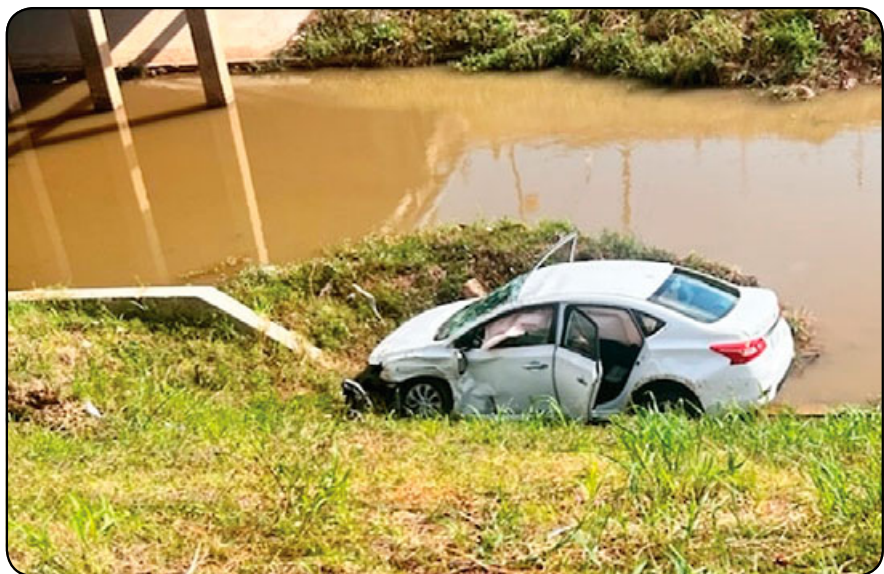
A vehicle recently fell into the Beamer Ditch at Scarsdale Boulevard during a two-car collision at the area intersection. According to Precinct 2 officials, two drivers suffered non-life-threatening injuries in the accident and were transported to a nearby hospital for treatment. The crash reportedly caused extensive traffic delays.