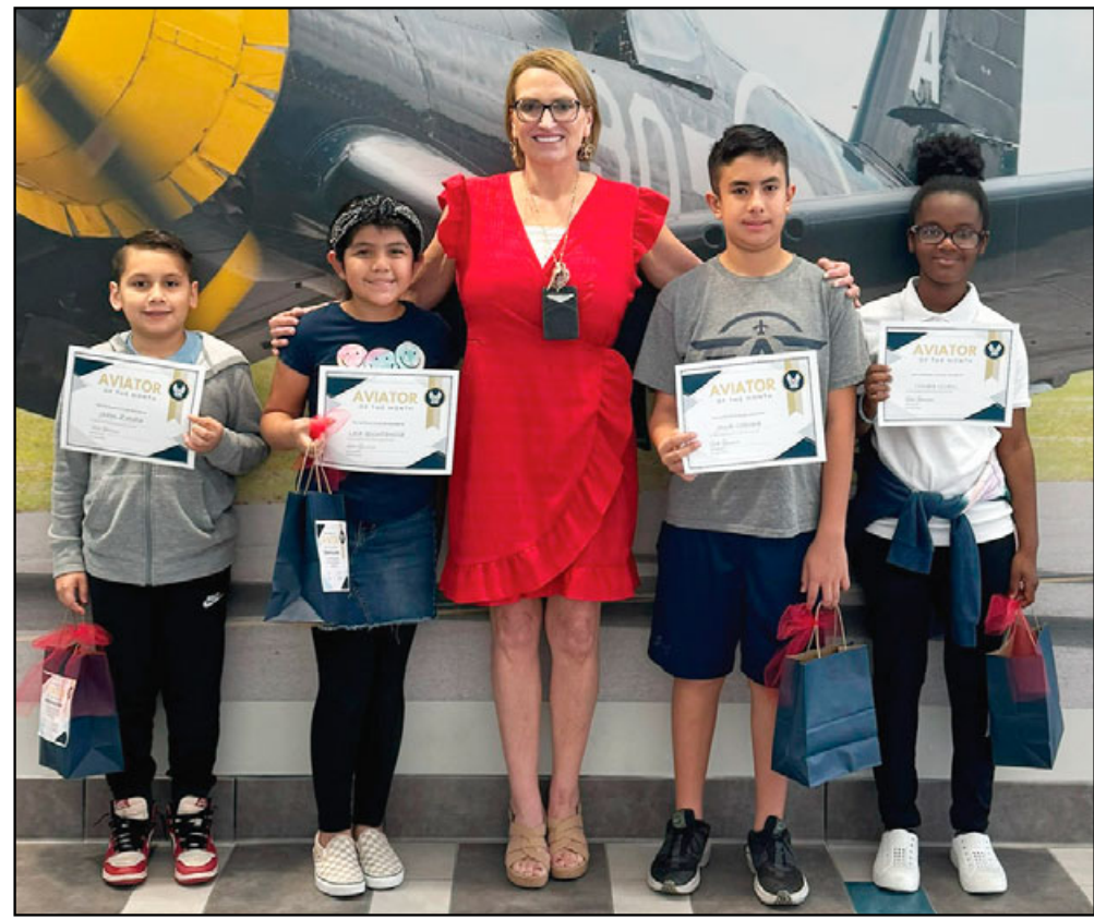
Fred Roberts Middle School announces their Aviators of the month for April. These students were chosen as the most well-rounded, meaning they exhibited many of the habits of success that were highlighted throughout the year; including empathy, execu-