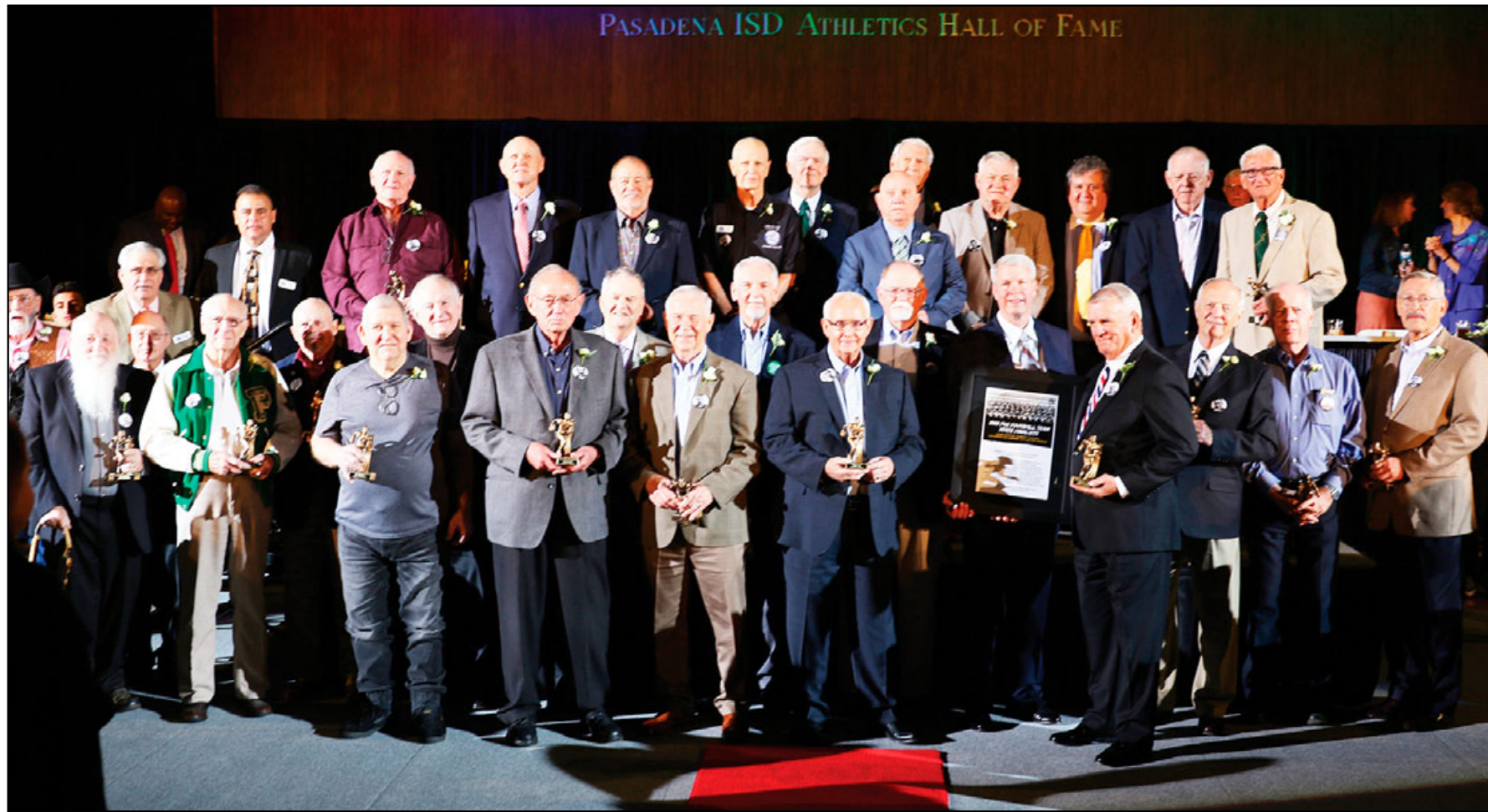
Many players from the 1958 Pasadena High School varsity football state finalist team reunited last month as the team was inducted into the Pasadena ISD Hall of Fame at Phillips Field House. To this day, the Eagles' 1958 team is the first and only PISD football program to reach the state championship game. That season, the team went 9-1 in the regular sea-