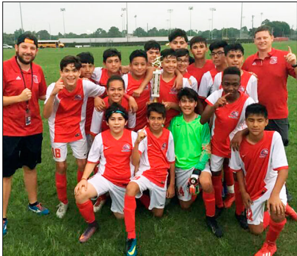
The Thompson Intermediate seventh-grade boys' soccer team closed out what was a dominating athletics season for the Lions during the 2018-2019 school year. In winning the Pasadena ISD soccer championship game at the seventh-grade level, the Lions completed a season that saw the school win a total of three football championships, three more in basketball and another in soccer. Members of the Lions' seventh-grade championship