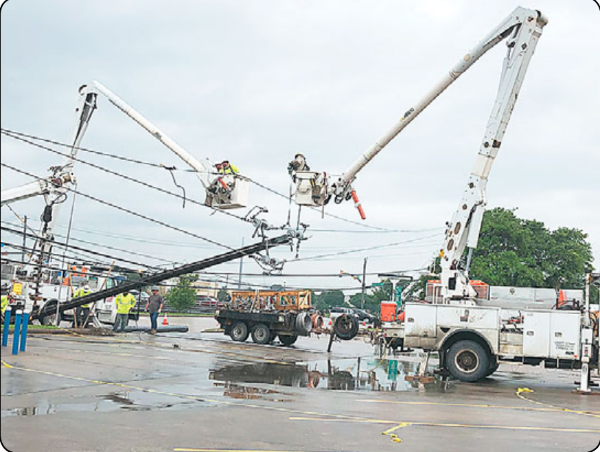
Severe weather once again struck the South Belt community, delivering nearly 5 inches of rain. Heavy winds accompanied the storms, causing massive power outages throughout the area. Emergency crews are shown above restoring power in the Food Town parking lot at the intersection of Scarsdale and Beamer. Local schools were forced to cancel classes, and several businesses were also forced to close.