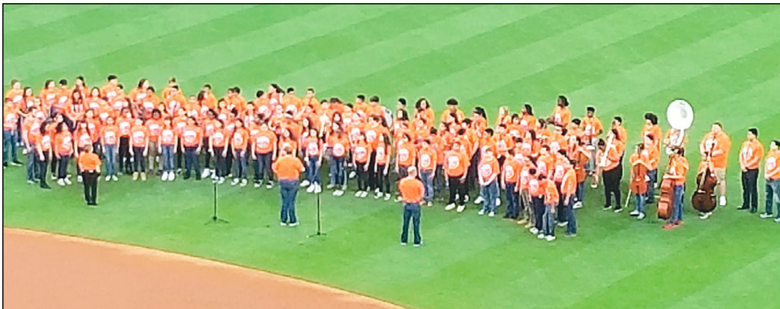
Some South Belt community members were surprised but happy to see the Beverly Hills Intermediate choir, band and orchestra perform "The Star Spangled Banner" at the Houston Astros game on Thursday, April 25. Although the Astros did not prevail in the subsequent game, the students performed well.