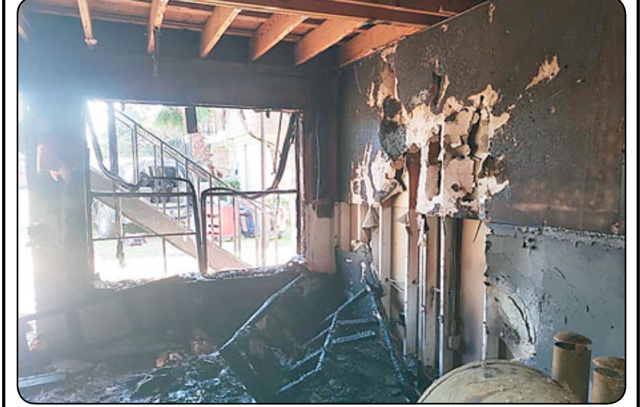
Firefighters responded to a six-alarm apartment fire at a complex in the 11800 block of Algonquin on Tuesday, March 26. The blaze completely destroyed one unit (shown above). Workers from Houston Fire Department Station 70 have organized a drive to help the victims recover. No injuries were reported. Emergency crews from stations 71, 52, 93, 94 and 61 also responded to this incident.