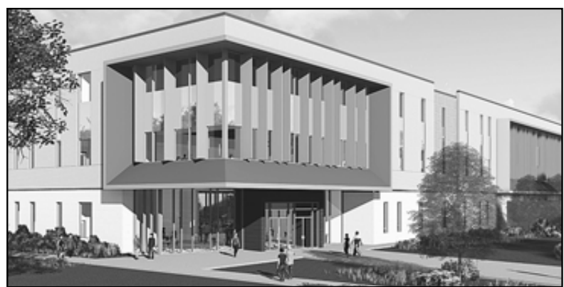
Artistic rendering of proposed health sciences and classroom building.

The health sciences and classroom building is one of three new academic buildings planned for UHCL. In March, the university broke ground on a STEM and classroom building and Recreation and Wellness Center on its Bay Area location. Later this year, it will begin construction on a student housing facility.