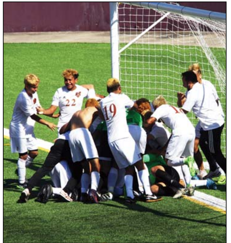
The crowning moment of the 2017 varsity boys' soccer season came as the Dobie Longhorns celebrated winning the program's first-ever Region III championship. The team did so by outlasting Channelview in a shootout.