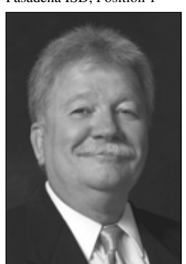
Age: 62 Occupation: Business Owner - Insurance