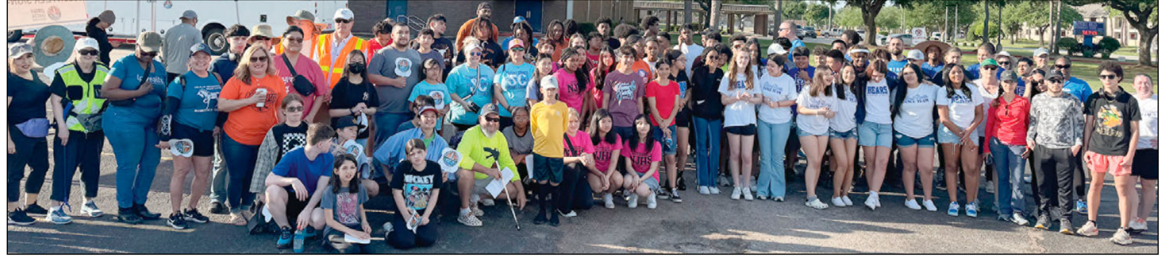
For the last 48 years, the Leader has had a rule; if pictures in the newspaper can be seen, we have to have the names. For the first time ever, the Leader staff will break that rule, since it would be nearly impossible to get all the names in a timely manner. The Leader staff was so impressed by the many residents who took part in the South Belt Cleanup Saturday, April 6, so for this time only, the Leader will break its own rule. The group did such a fantastic job that the group at least deserves having its picture, even if all the names were not available. The South Belt community owes the group a huge "thank you". See additional photo on Page 1.