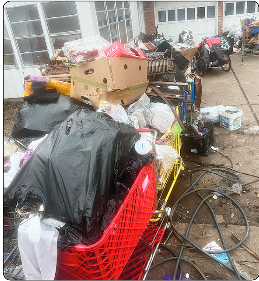
This house in Freeway Manor has reportedly been taken over by squatters and apparently will be returned to family members shortly. The original owner is reportedly deceased. See next week's South Belt-Ellington Leader for information on what can be done to avoid having one's home taken over by squatters.