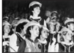
Members of the Janettes anxiously cheer on their Trojan football team in a 1966 contest. The 1966 season marked the drill team's debut.