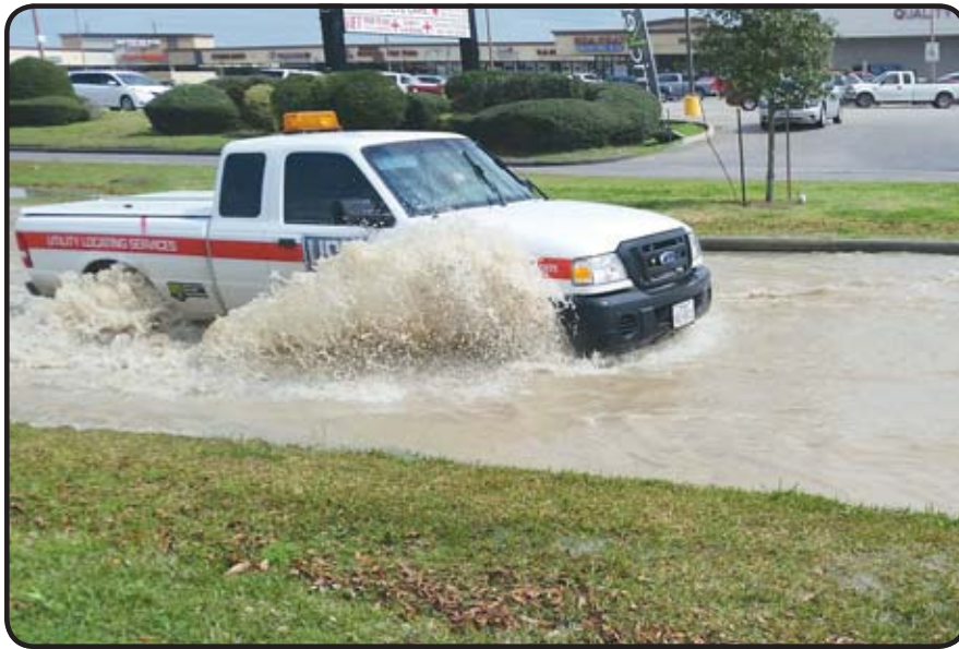
A blowout in a water main near the intersection of Scarsdale and Beamer caused extensive flooding Tuesday, March 3. The blowout was reportedly caused by pressure from a storm sewer line that runs under the main. The damage, which took more than an hour to repair, affected roughly two-thirds of the Clear Brook City Municipal Utility District, according to MUD General Manager Chris Clark.