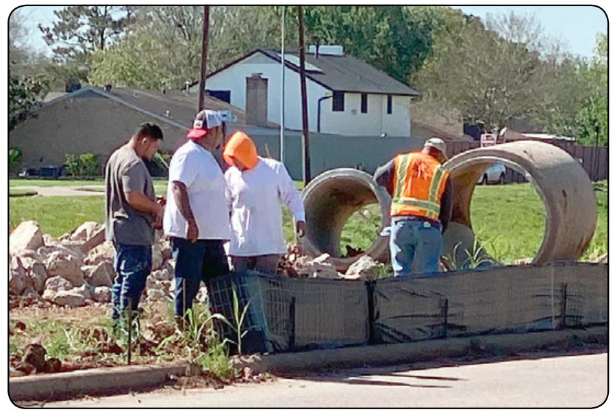
Work recently resumed on the county's Beamer Ditch project after being dormant for months when the original contractor abandoned the job. In January, Harris County Flood Control District selected Rebel Contractors as the construction company to complete the project. Complete Concrete was originally awarded the low-bid contract to widen the ditch and install concrete lining from Sagerock to near Dixie Farm Road.