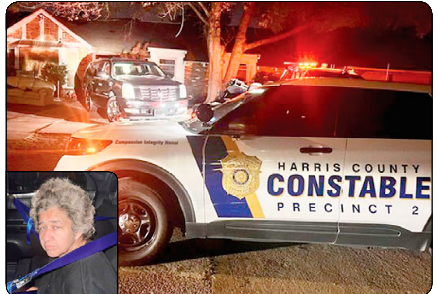
A call about suspicious persons in the 8100 block of Wilmerdean near Hobby Airport March 4 led to a felony arrest and the recovery of a stolen vehicle. According to Precinct 2 officials, deputies were dispatched to above address after receiving complaints of individuals going through a neighbor's property. One of those individuals had an outstanding felony warrant and was arrested (inset) Further investigation discovered the stolen vehicle.