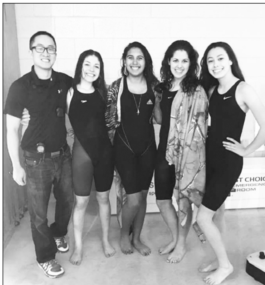
Dobie's 200-yard medley and 200-yard freestyle relay teams reached regionals this season, bettering their previous best times in both and setting a new school record in the 200-free. Those with Dobie head

"All you want is a great effort, and my kids definitely give that for the entire season."