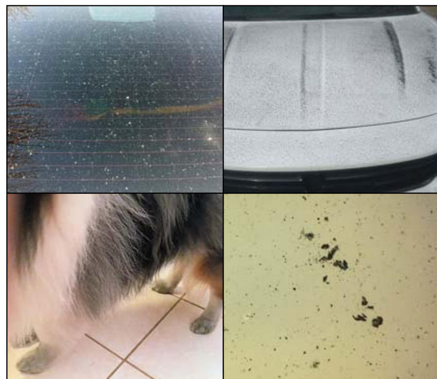
Numerous South Belt residents have complained to the Leader about soot resulting from the burning of trees and brush at the site of the future detention pond near Beamer and Dixie Farm Road. Both the upper left and lower right photos shown above are from windows, while the upper right photo shows the hood of a car, and the lower left photo shows a dog's paws that have gotten dirty from the debris.