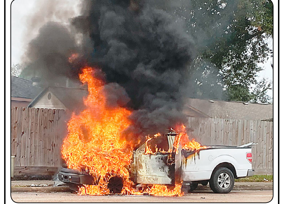
A truck caught fire the morning of Wednesday, Jan. 26, on Sabo near Gulf Pointe Drive. At press time, it was unclear what caused the blaze. No injuries were reported. Black smoke from the fire could be seen for several miles from the scene.