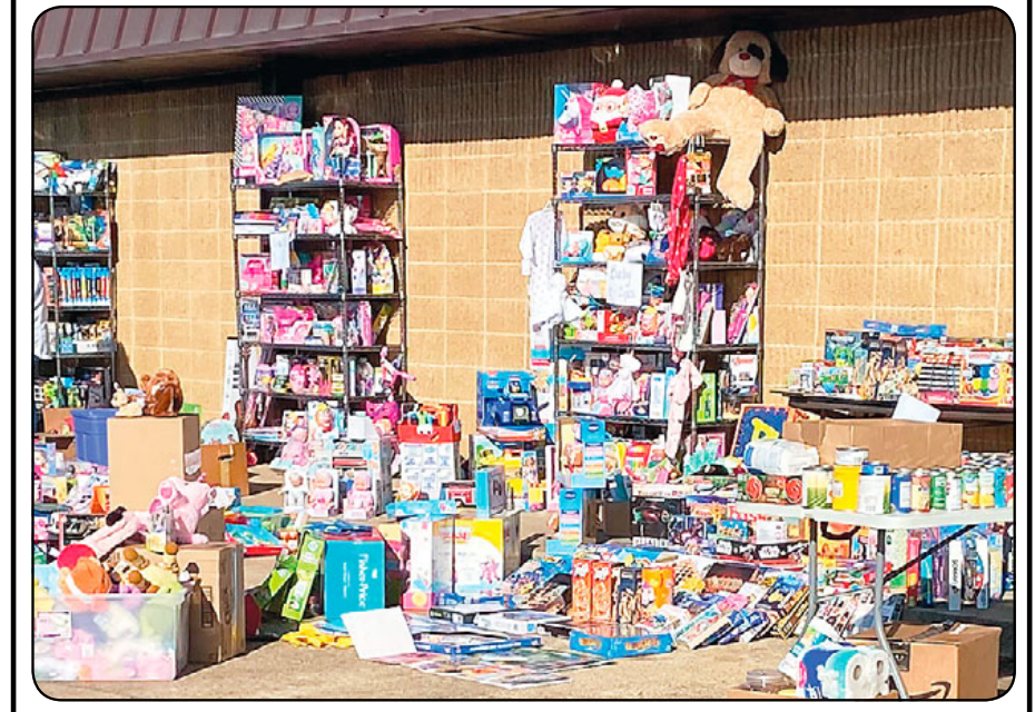
A Christmas program that looked like it was in trouble early a week before Christmas, became the most successful program in the event's 38-year history. All thanks to the giving spirit of the South Belt area. (See story this page, editorial Page 2 and the first issue next year on Jan. 7 for additional details.)