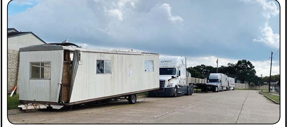
A line trucks and trailers on Kirkholm Drive near Beamer, across from Beverly Hills Intermediate, is angering residents who complain the large vehicles impede traffic near the area school, as well as cause an eyesore and safety hazard. At least one of the trailers (shown above) is open, allowing students to enter. While parking the vehicles, sometimes up to seven deep, on the street during daylight hours is illegal, city workers have failed to enforce the ordinance, and county workers are prohibited from doing so. The Leader is reaching out to Pasadena ISD police for assistance.