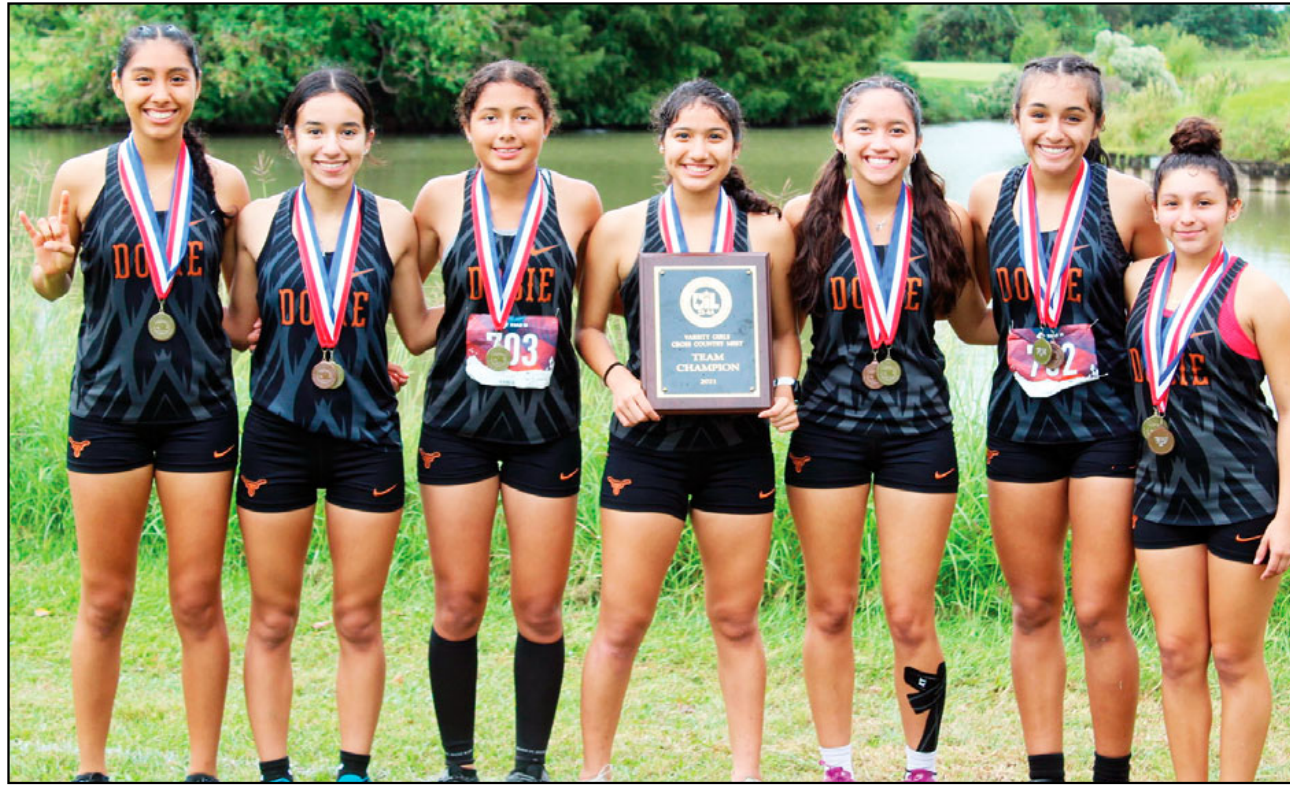
The Dobbie varsity girls' cross-country team repeated as District 22-6A champions after dominating the competition at the league meet Oct. 14 at the Jimmy Burke Center in Deer Park. Dobbie's championship team that will now compete at regionals Oct. 25 in