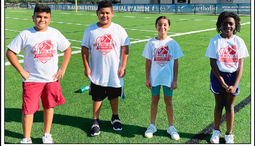
Stuchbery Elementary Punt Pass and Kick winners represented their school in the districtwide Punt Pass and Kick competition on Monday, Oct. 4 at Veterans Stadium.