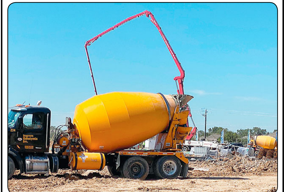
Construction recently began on the new Thompson Intermediate campus, to be located in the 8700 block of Hughes Road. The school was originally to be built on Highland Meadows Drive in the Riverstone Ranch at Clear Creek subdivision, but was met with opposition from surrounding residents. The current Thompson campus suffered extensive damage during Hurricane Harvey, forcing students to be temporarily housed at Beverly Hills Intermediate. The new campus is expected to open by fall 2023.