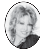
RAQUEL WELCH™ SIGNATURE COLLECTION OF WIGS & HAIR ADDITIONS

The Right BRA, The Right Form! by JODEE Caring Fitters Trained & Certified to Help With All Your After Breast Surgery Needs. Great selection of Mastectomy Swimsuits