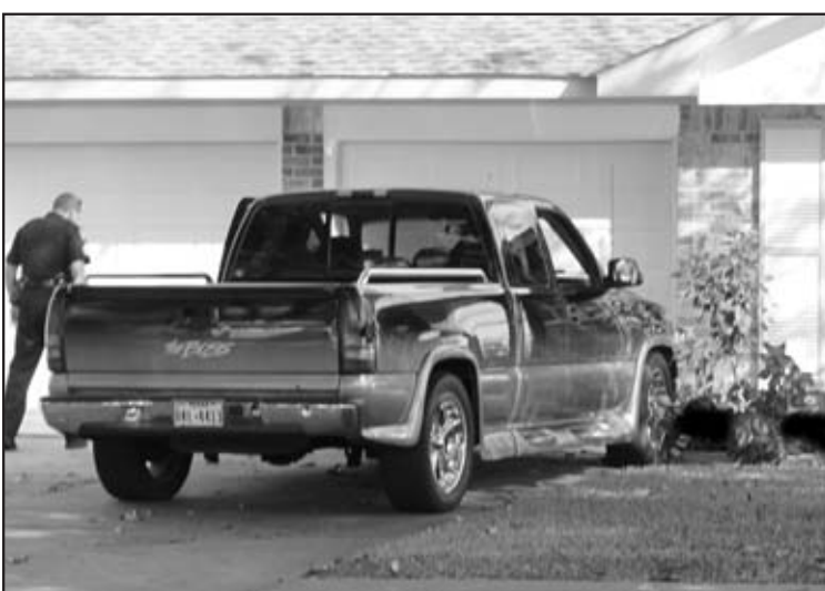
City of Houston and Pearland police are shown investigating the shooting of a Kirkwood resident Wednesday morning on Kirkmeadow Street. The shooting ended at the home of the suspect after a chase which started in Liverpool, outside of Pearland. See related story Page 1A.