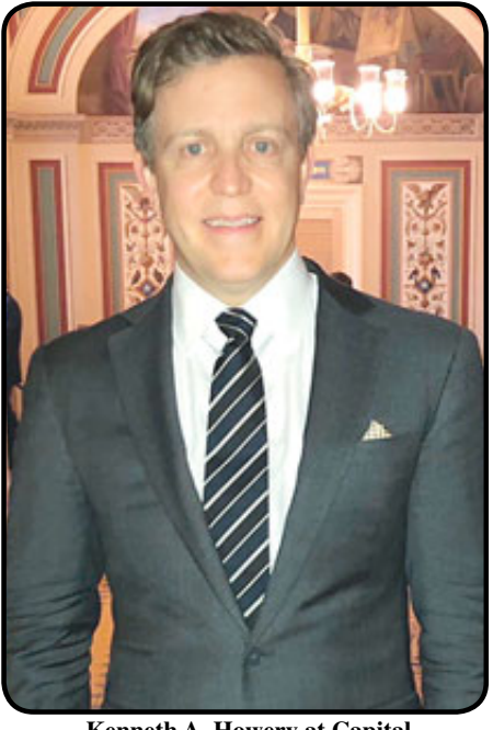
Kenneth A. Howery at Capital

In a speech to the U.S. Senate at his nomination, Howery said he was honored to represent the United States in Sweden.