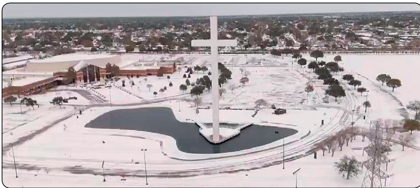
The South Belt community received a rare flurry of snowfall this past week, with the area receiving 3 to 4 inches of snow. Many residents took to social media to share their photos of the unusual occurrence, memorializing the occasion. The aerial drone footage of snow-covered Sagemont Church shown above was shared to the People of Sagemont 2 Facebook page.