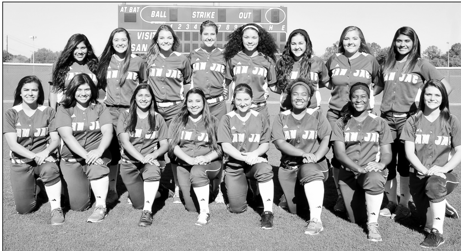
The San Jacinto College softball team will open the 2016 season at the Galveston Whitecaps Invitational Friday and Saturday, Jan. 29-30, on the island. Over the two days, SJC will play five games, including a Jan. 30 tussle with National Junior College Athletic Association Division II power LSU-Eunice.

But sometimes that's just the way it goes. In any case, the competition may change one way or another, but the difficult push to make the postseason in any sport will persist into the future.