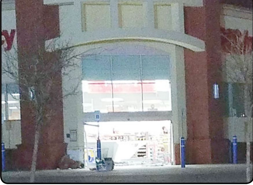
A group of at least six thieves used a stolen vehicle to smash through the front entrance of the CVS located in the 9400 block of Fuqua at Blackhawk early Thursday, Jan. 18, to gain access to the store's ATM. South Belt resident Russell Harder took the above photo on his way to work around 5 a.m. the morning of the burglary. The remnants of the ATM can still be seen in the parking lot.