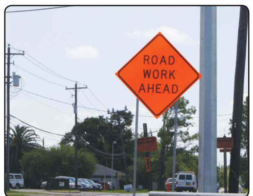
Harris County Precinct 1 workers are scheduled to resurface Hall Road from Beamer to Blackhawk beginning in early October. The project was bid out as part of a larger resurfacing endeavor, and no exact costs were announced, county officials said. The road will not be completely closed, but congestion is expected.