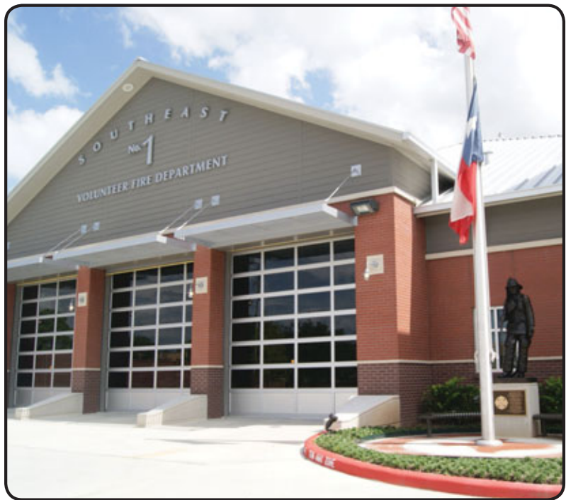
The new Southeast Volunteer Fire Department station on Scarsdale Boulevard is nearing completion and is due to open in late October once the building has received final approval from the fire marshal's office. A community open house will coincide with the building's completion.