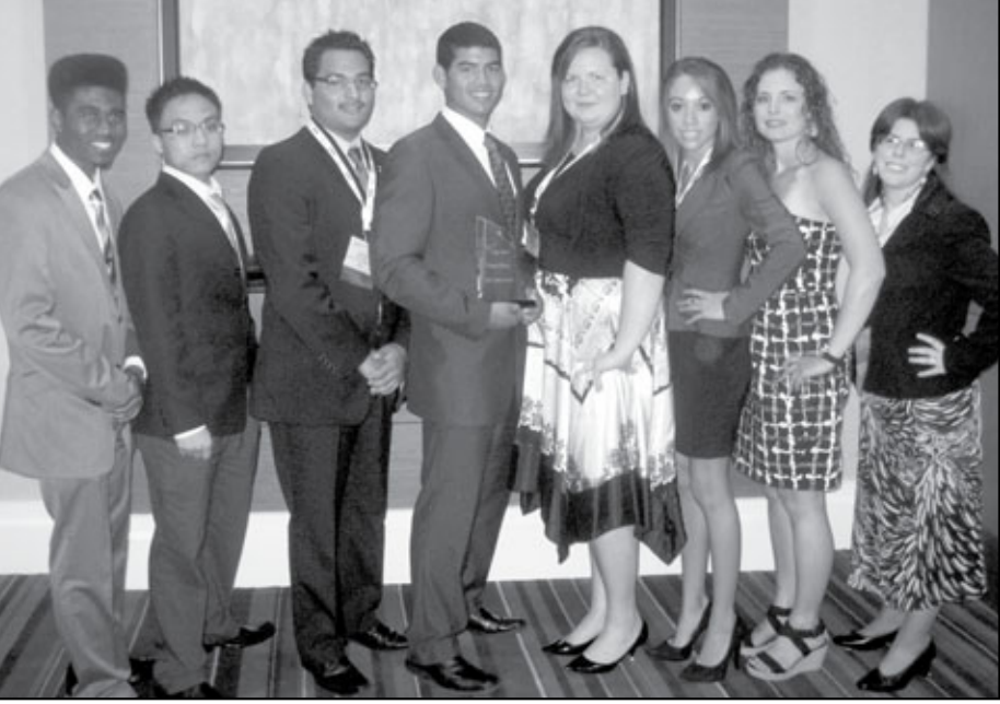
Phi Beta Lambda business fraternity members of the San Jacinto College South chapter recently attended the Institute for Leaders, and National Leadership Conferences, in Orlando. Both annual conferences are hosted by the national fraternal organization and include workshops and activities that focus on leadership, team building, public speaking, business ethics and job interviewing.