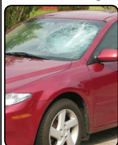
Deputies from the Harris County Precinct 2 Constable's office responded to 10 separate criminal mischief calls Tuesday, May 10, where automobile windows had been smashed. It is presumed the incidents occurred the night before. Most of the acts of vandalism took place near the intersection of Blackhawk and Astoria. Anyone with information regarding these incidents is urged to call 281-481-9189.