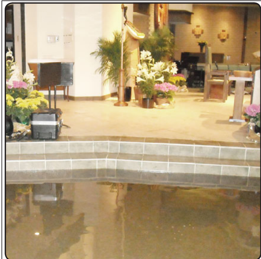
The chapel at The Catholic Community of St. Luke the Evangelist took in several inches of rain during Saturday's storm. While the floodwater forced the cancellation of Saturday's evening Mass, the parish reopened the following day, holding Sunday Mass in its social hall. Submitted photo

Heavy rainfall struck the South Belt area hard Saturday, April 18, killing one and leaving dozens of others stranded in their vehicles.