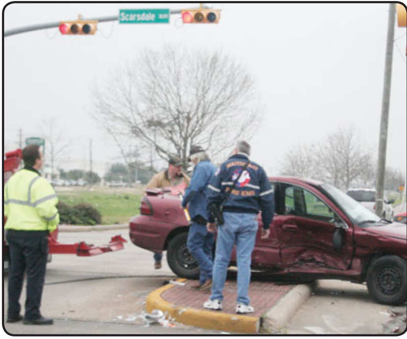
The driver of a blue Honda was headed south on Beamer Tuesday, Feb. 23, when the driver of a red car travelling west on Scarsdale apparently ran the red light at the intersection of Scarsdale and Beamer hitting a light pole. The driver of the red car sustained minor injuries and was transported by ambulance to Memorial Hermann Southeast Hospital. The driver of the blue Honda was apparently unharmed.