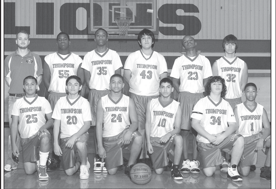
Thompson Intermediate's seventh-grade Light boys' basketball team won the Pasadena Independent School District regular-season title with an 8-1 record after downing Park View in the final week of play. The Lions then defeated three opponents, including Park View in the title game, to win the district tournament.